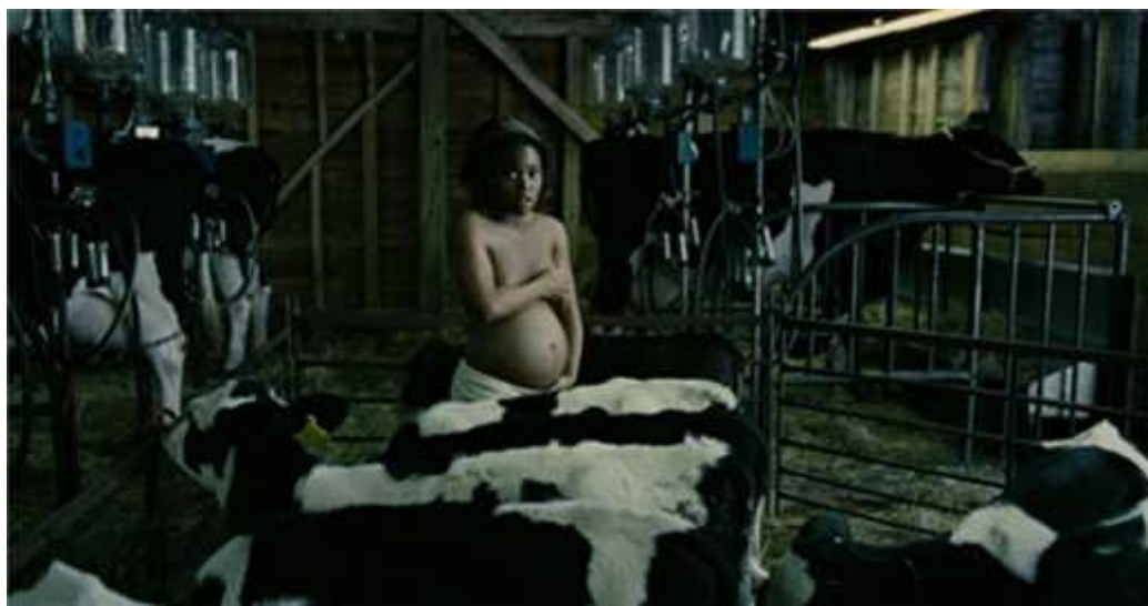
Fig. 2 – Still from Cuarón's Children of Men : the moment of the epiphany

In the end of both novel and movie, the birth of Julian's/Kee's baby may or may not represent a new beginning for the human race. Accepting the child as such would mean acknowledging the return to a previous state of humanity, which allows and enables organic flaws to exist in full. Interestingly, neither book nor film present a sense of closure and new beginning. Readers and viewers alike are not certain of the baby's fate. Thus, the narrative is dubious about the fate of the very essence of dystopian, transhuman society as accepting the baby as the new beginning, a baby whose origins are essentially human (rather than posthuman) would mean reverting to a previous state where capitalist control over one's desire for immortality was more lax. However, this is the ultimate irony in both novel and film: the birth of the baby after over 20 years of worldwide infertility may save humankind from extinction but the price is a partial abandonment, at least, of capitalist policies of corporeal control (given that the baby was generated naturally).